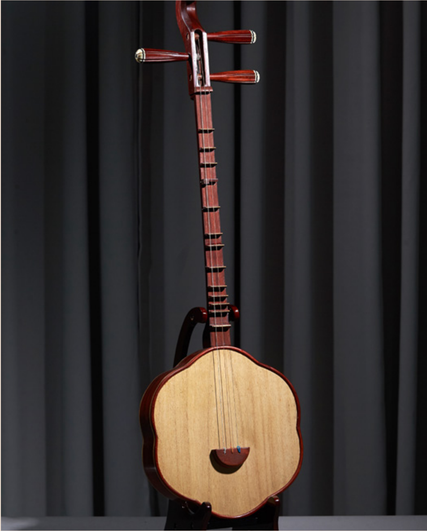
CANTONESE QIN QIN